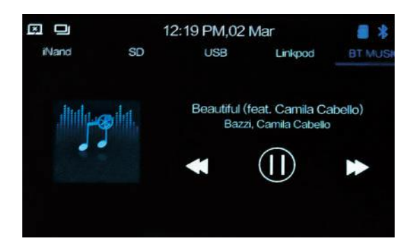
USB/Bluetooth connectivity for Music

Connect to a hotspot internet network to access online apps for music, navigation and many more.