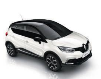
PEARL WHITE WITH DIAMOND BLACK ROOF*