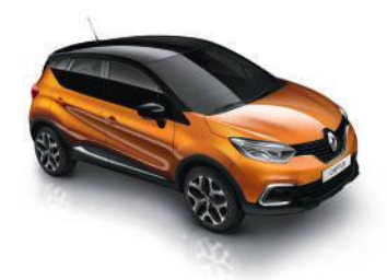
ATACAMA ORANGE WITH DIAMOND BLACK ROOF