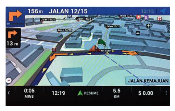
Online & Offline Navigation

CAPTUR's new 7-inch touchscreen infotainment provides access to useful and practical features, including online & offline navigation, connectivity, and hands-free telephone using Bluetooth® technology.